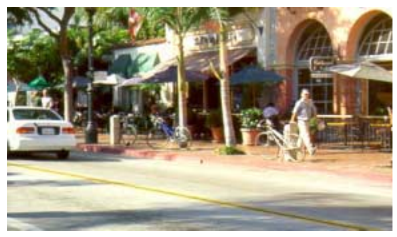
Zoning ordinances should include provisions for bicycle parking that indicate how many spaces are required within specific districts.

endorsed. A set of possible criteria are listed in the Specifications section below. Next, give each task group its marching orders. They are as follows: