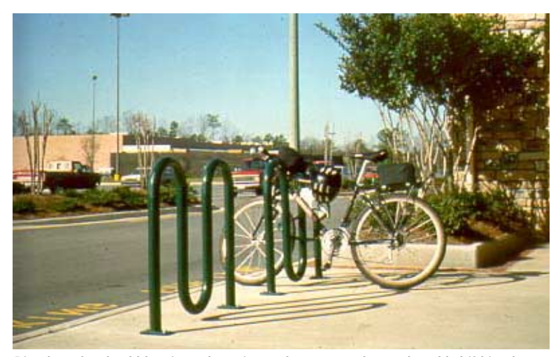
Bicycle racks should be situated on site so that more racks can be added if bicycle use increases.