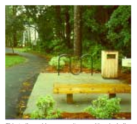
This trail provides many site amenities, including short-term bike parking.

Bicycle parking can be provided in a wide variety of settings using three basic approaches: bicycle racks (open-air devices to which a bicycle is locked), bicycle lockers (stand-alone enclosures designed to hold one bicycle per unit), and bicycle lock-ups (site-built secure enclosures that hold one or more bicycles).