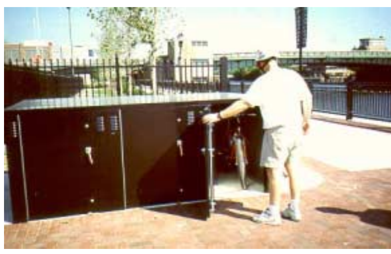
Bike lockers should be made available in areas where long-term parking is necessary.

1. Bicycle parking facilities shall be provided as required for all new structures and uses established as provided in Sec. 28.11(2)(a)1 or for changes in use as provided in Secs. 28.11(2)(a)2 and 3; however, bicycle parking facilities shall not be required until the effective date of this paragraph. Notwithstanding Secs. 28.08(1)(i)