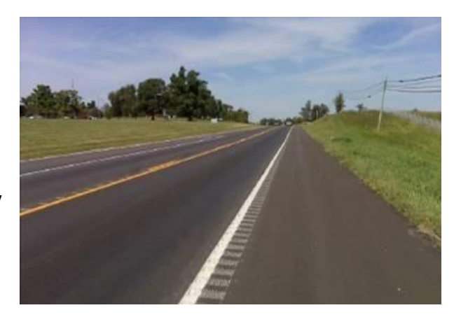
KYTC is installing hundreds of miles of rumble strips/stripes in conjunction with its pavement

Kentucky used the customized Implementation Plan and local knowledge of safety problems and effective countermeasures to begin implementing solutions to reduce roadway