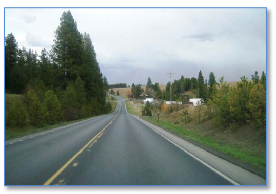
Idaho 8 Corridor

The Idaho Transportation Department (ITD) contracted with a consultant to conduct a comprehensive review of existing Idaho State Highway 8 (Idaho 8) corridor conditions. The review identified deficiencies related to traffic operations, roadway geometry and cross section, access control, and safety with an overall purpose to identify and prioritize operational improvements over a 10-year period. FHWA's IHSDM was used to evaluate existing traffic, roadway geometry, and predict crashes using these and the corridor's recent crash history.