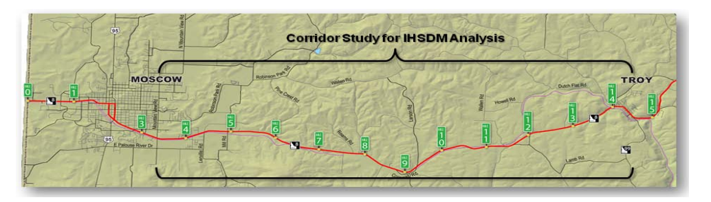
Figure 1: Idaho 8: Corridor Study Area Map

The Idaho 8 Corridor Study evaluated approximately 11 miles of Idaho 8, from Moscow to Troy, Idaho. The corridor consists of a two-lane highway, characterized by rolling terrain traversing through primarily rural residential and agricultural development. Idaho 8 is classified as a minor arterial with current annual average daily traffic (AADT) ranging from 8,600 vehicles per day (vpd) at the west end of the corridor (Moscow); to 2,600 vpd at the east end (near Troy). The corridor has an average of five percent heavy vehicles.