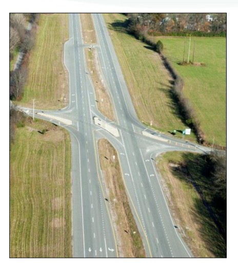
J-Turn Intersection.

Finally, Missouri used the ISIP to initiate corridor-level intersection improvements for portions of U.S. Route 54 and U.S. Route 30. The improvements involved both low-cost and higher-cost infrastructure, education, and enforcement activities along the corridors. The State reconfigured several two-way, stop-controlled intersections on atgrade expressways to incorporate J-turn treatments to address highspeed angle crashes. Although J-turn intersections are higher-cost improvements, they are proven to be very effective at improving intersection safety along high-speed divided highways with crash histories. The early success with J-turns has helped it gain traction; in 2008, Missouri had only one J-turn intersection, but—by the end of 2015—there were 19 J-turn intersections installed across the State.