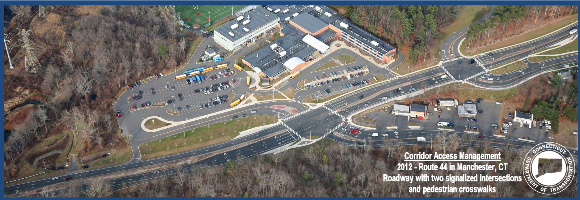
Corridor Access Management 2012 - Route 44 in Manchester, CT Roadway with two signalized intersections and pedestrian crosswalks