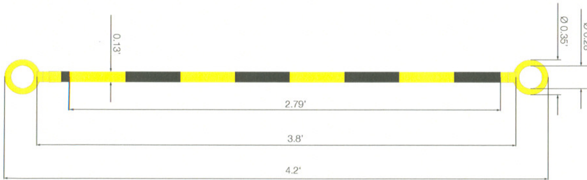
1. Original Length