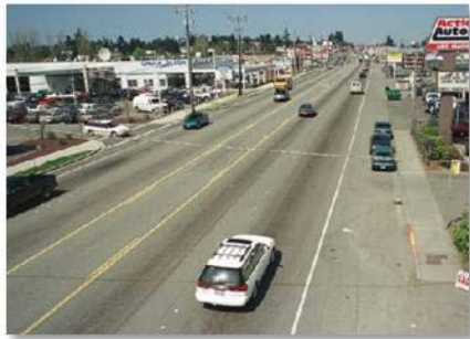
EXHIBIT 5 Project Alternatives for the Example Application

Exhibit 5 illustrates and describes the three project alternatives: a no-build scenario, Alternative 1 and Alternative 2.