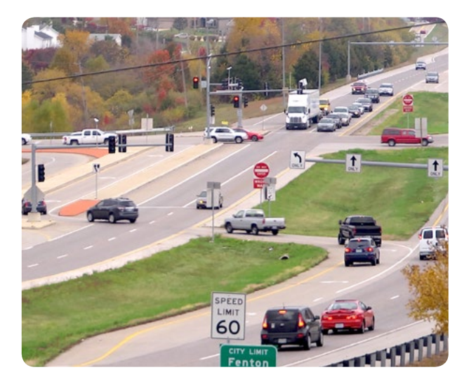
Fenton, MO DLT Intersection