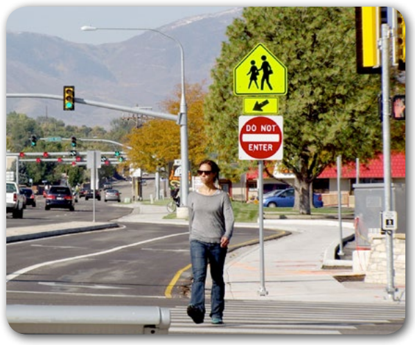
Salt Lake City, UT DLT Intersection

A DLT also can support community goals for pedestrians and bicycles. Provisions for walking and biking must be considered throughout the project development process, with the needs of pedestrians and bicycles shaping the overall design of the DLT accordingly. This includes pedestrian crossings that are accessible to all users , and traffic signal phases that accommodate both pedestrians and bicycles.