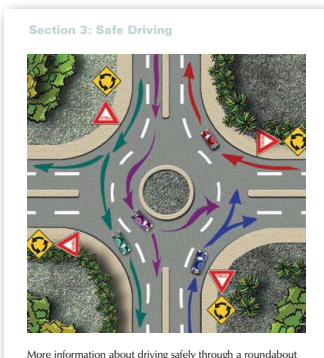
Figure 2: Sample slide from VDOT's public outreach presentation.

wore information about driving safely through a roundabout is available at the Virginia Department of Transportation web site at http://www.virginiadot.org/info/faq-roundabouts.asp.