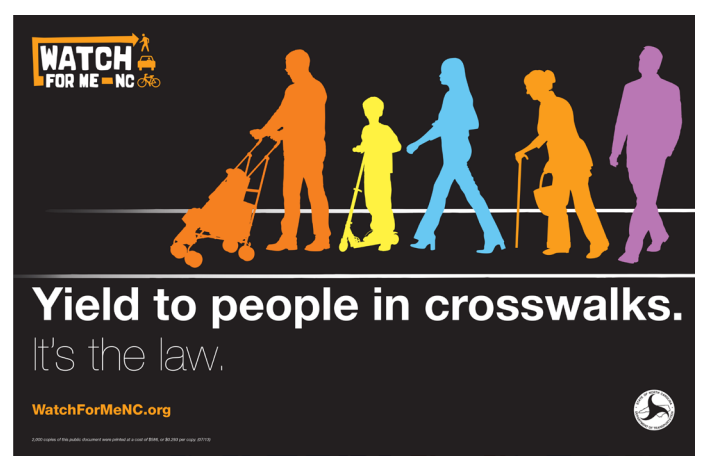
Figure 1. Graphic. Watch for Me poster.

cities must describe both their commitment to promoting pedestrian and bicyclist safety and their capacity for promoting the campaign and coordinating with law enforcement.