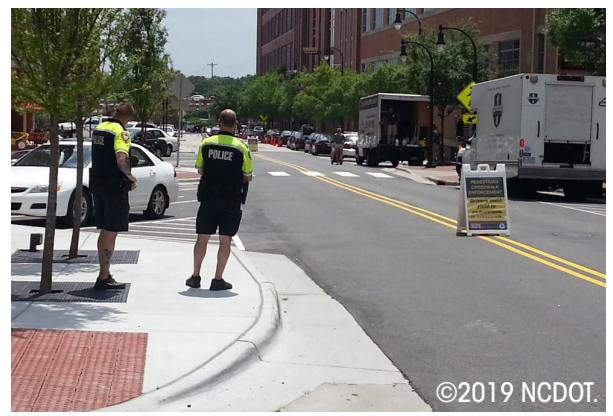
Figure 2. Photo. Law enforcement participates in Watch for Me event.

The program also provides law enforcement officers with bike lights and reflective bracelets to distribute to children and adults traveling in low-light conditions, creating positive police-resident interactions.