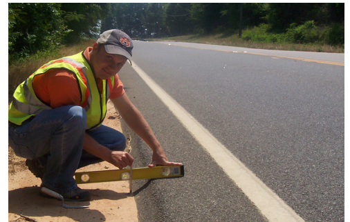
Example of the SafetyEdge SM after backfill material settles or erodes.

Transportation agencies should develop standards for implementing the SafetyEdge SM systemwide on all new asphalt paving and resurfacing projects where curbs and/or guardrail are not present, while also encouraging standard application for concrete pavements.