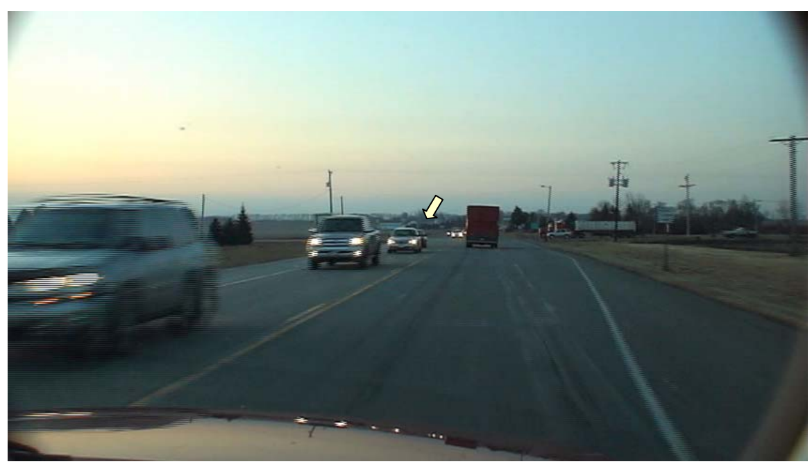
TH 3 southbound just north of 170th Street at about 7:30 AM. Photo illustrates a platoon of northbound vehicles following too closely (barely a skip stripe apart or less where there should be at least three to four skip stripes between vehicles at 55 mph for a safe two second headway)