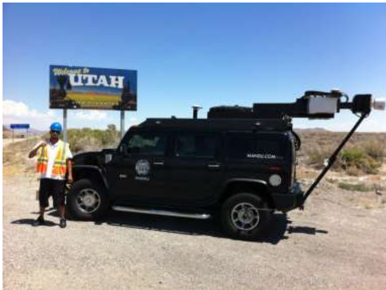
Figure I The contractor's vehicle with LiDAR sensors and other equipment

Figure I depicts the vehicle used by the contractor to collect the roadway asset data.